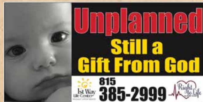
RLMC partners with 1st Way Life Center on pro-life billboard.