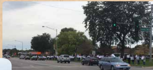
RLMC organized the annual Life Chain in Crystal Lake, which is a national, peaceful, and prayerful public witness of pro-life Americans, standing for one-hour along our roadways, praying for our nation and for the end to abortion.

We had a great turnout at the 2019 Life Chain!