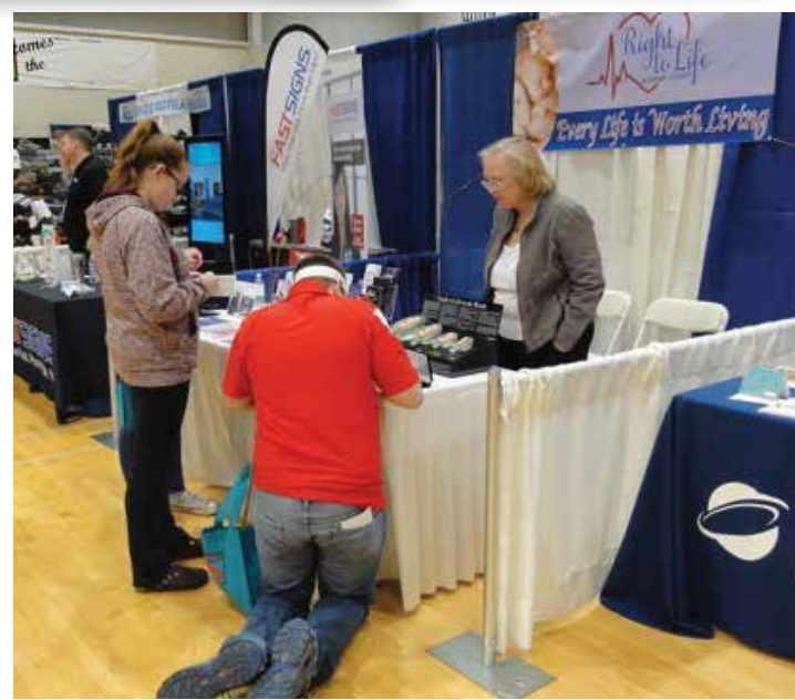
Right to Life McHenry County has participated in the CL Expo since 1995.