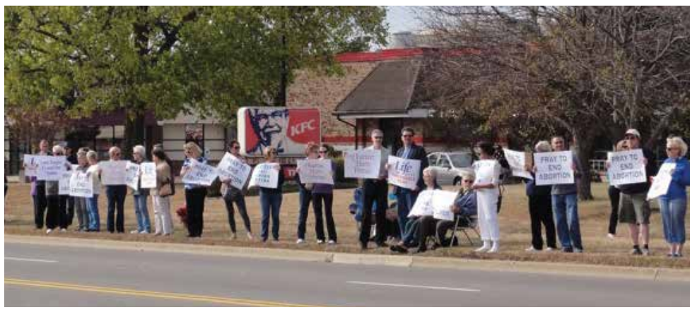
Life Chain is a national, peaceful, and prayerful public witness of pro-life Americans, standing for one-hour along our roadways, praying for our nation and for the end to abortion.